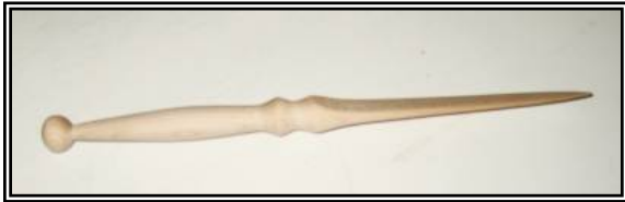
A white maple letter opener made by Jim Underwood.