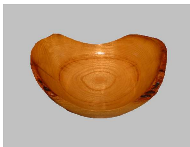
A natural edge osage orange bowl turned by Ron Leuthner