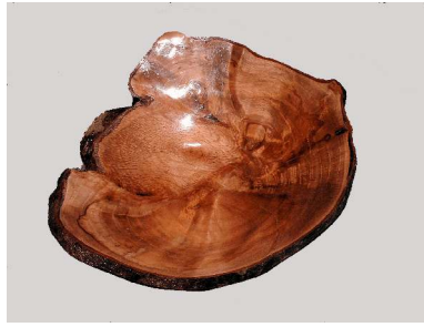
A natural edge oak bowl turned by Roger Jessup