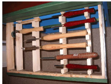
Turning tool rack built by Bill Van Wie