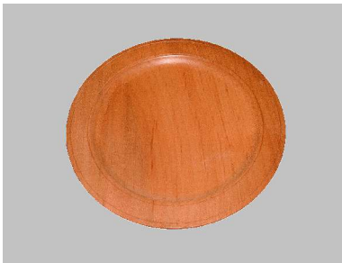
A classic maple platter turned by Bob Foote