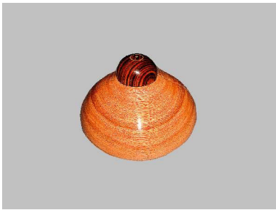
An attractive hollow form turned by Lou Kudon