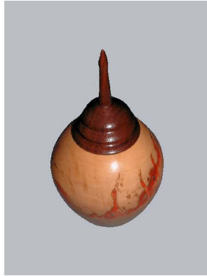
A very nice lidded urn turned from box elder and walnut by David Luther