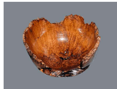
A natural edge maple bowl turned by Ron Leuthner