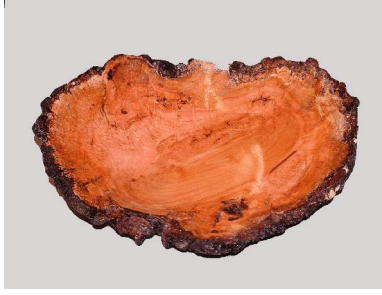
A natural edge platter turned from a cherry burl by Roger Jessup