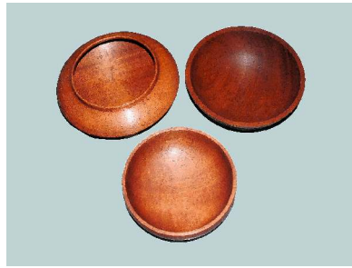
Three very nice bowls turned from mahogany and maple by Bob Foote