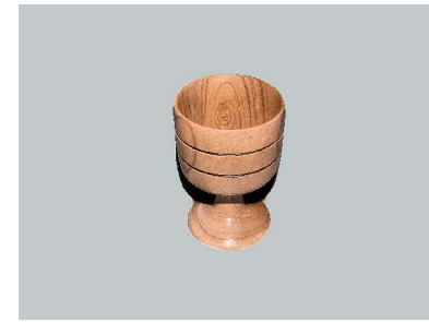
An attractive goblet turned from magnolia by Dean Brady