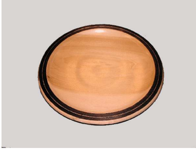
A very nice poplar platter turned by Roger Jessup